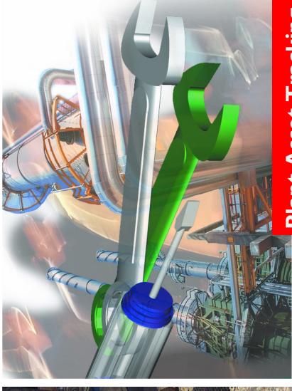
Plant Asset Tracking